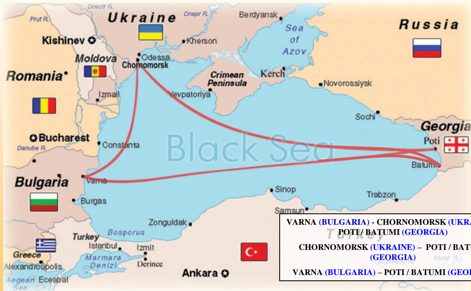
Map of Navibulgar regular ferry services in Black Sea